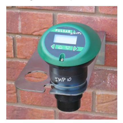
Optional mounting bracket for IMP sensors