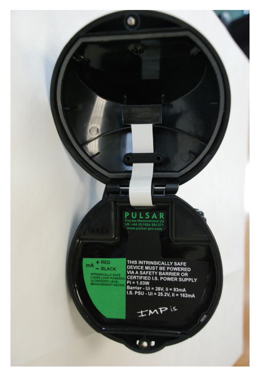
Inside the lid of an IMP+ I.S.