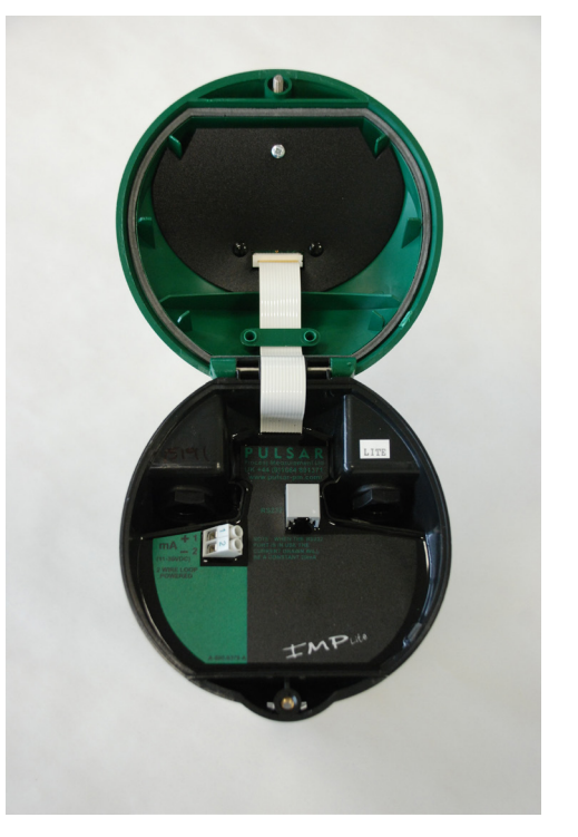
Inside the lid of an IMP Lite