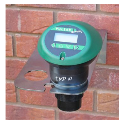
Optional mounting bracket for IMP sensors